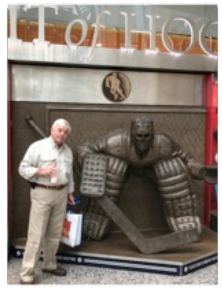
Hockey Hall of Fame and the Air Canada Center